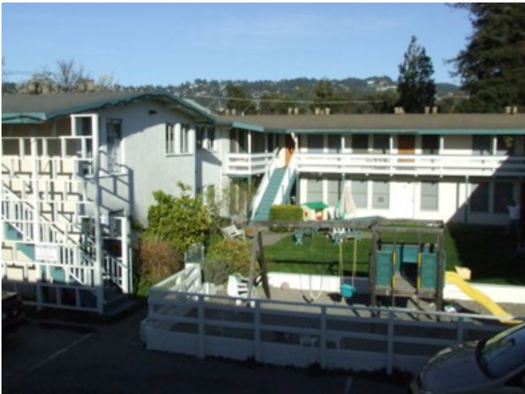
A second-story view of the Delaware Apartments east wing and courtyard.

In addition to a new workout room, we are also pleased to announce a new study lounge in Beasom Hall, equipped with several lounge chairs, desks, and tables, as well as a small reference library! The former dorm room is now available for student meetings and study sessions to any PLTS student or staff.