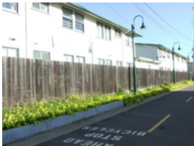
A side-view of the Delaware Apartments from the bordering bike trail.