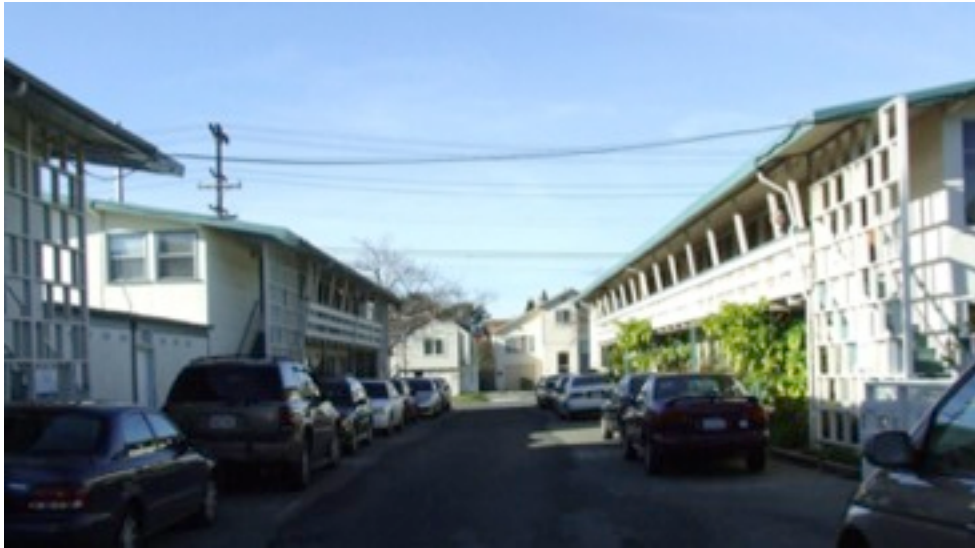
A northern view of the Delaware Apartment entrance